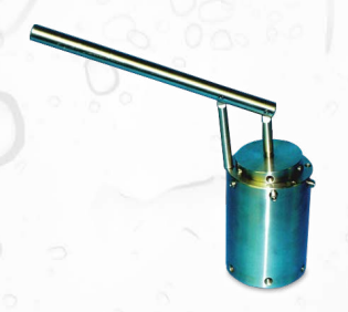
#170-33 Cell Cap Puller