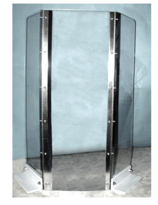
Safety Shield (#171-06)