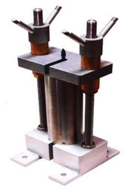
Safety Clamp (#170-92) (Set Screw Cell Assemblies Only)