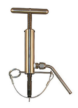
HTHP Pressure Relief Tool (#170-91) (To release trapped pressure)