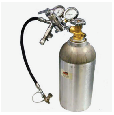
High Pressure Nitrogen Assy. (#171-31)