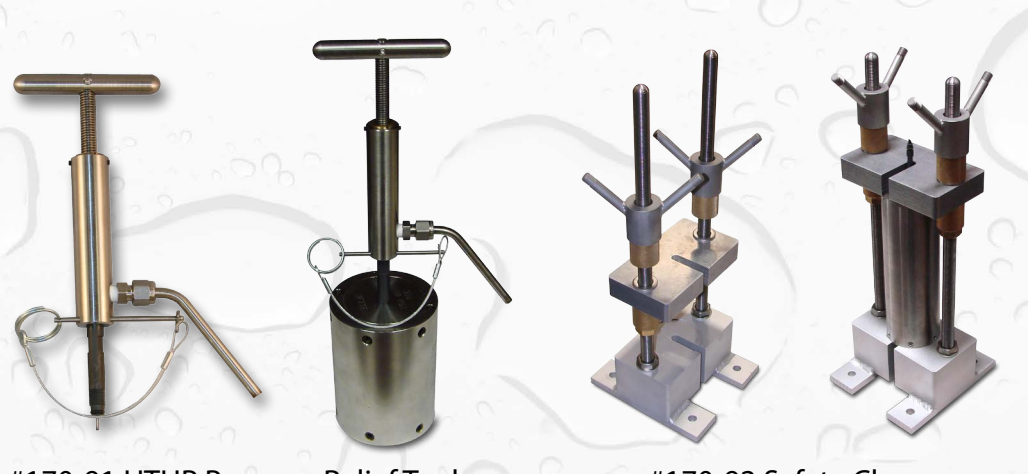
#170-91 HTHP Pressure Relief Tool