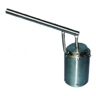
Cell Cap Removal Tool (#170-33) (Set Screw Cell Assemblies Only)