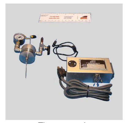
Thermocouple Assembly (#171-45-1) (Direct temperature measurement of the fluid inside the cell)