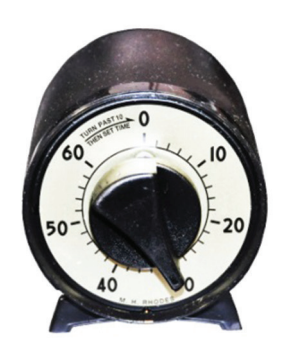
Interval Timer, 60 minute (#155-20)

The items listed below are not included in the HTHP Filter Press, but they are items that will enable the technician to perform a more uniform and reproducible test while maintaining a high degree of safety. As optional items, the usage is not compulsory, but consideration should be given to these items when running tests at elevated temperatures and pressures.